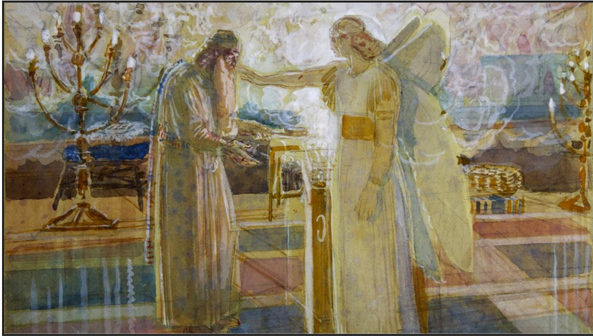
Zechariah and Holy Silence

READING Romans 4:13-25 GOSPEL Luke 1:1-25