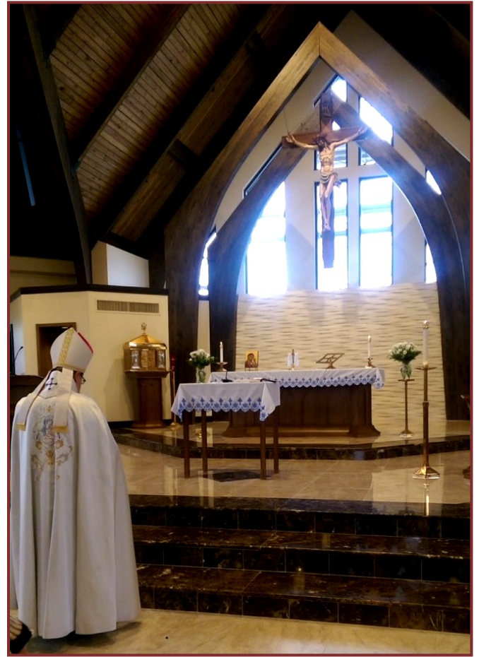
First Mass at St. Sharbel Maronite Catholic Church Clinton Township, MI May 5, 2018