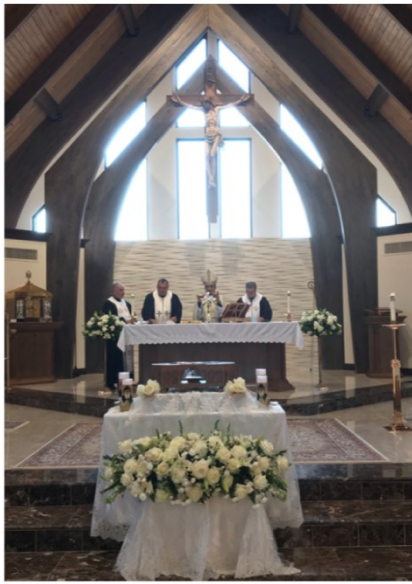
The Feast of Saint Sharbel with the First Class Relics of Saint Sharbel Makhoul