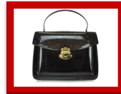
LOUIS VUITTON Vernis Romaine Bag Amarante Valued at $4300

This tote is crafted of Louis Vuitton monogram embossed vernis patent leather. The bag features a smooth leather top handle and a signature brass press lock for the frontal flap. This opens to a fabric interior. This is an ideal bag for day or evening, from Louis Vuitton.