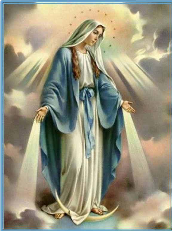
Heavenly Assumption of Mary

READING 1 Corinthians 12:1-11 GOSPEL Matthew 12:22-32